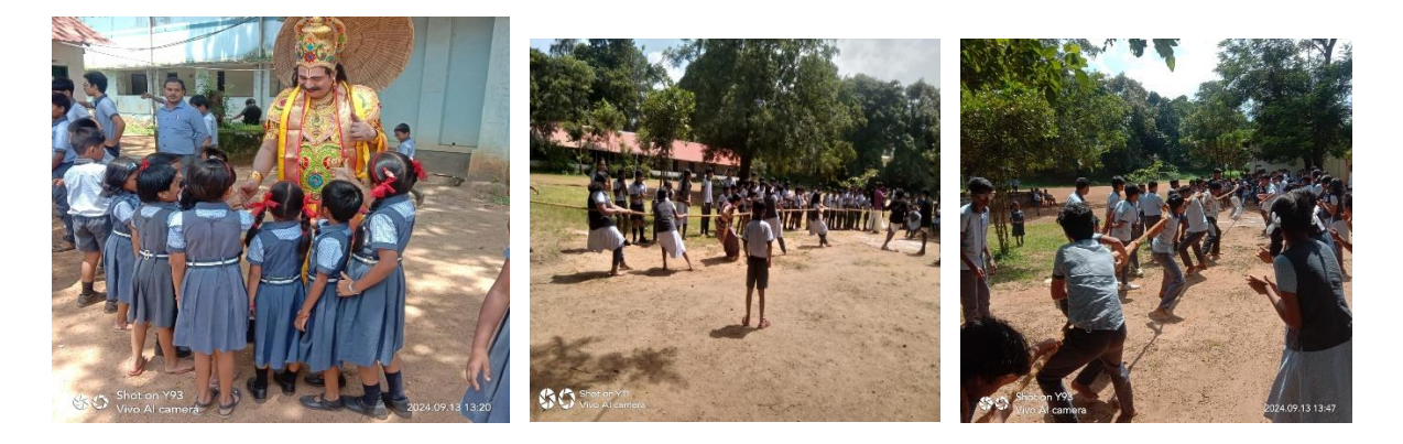
Onam sweet distribution by PTA